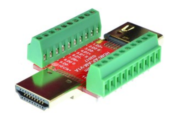
Figure 4: HDMI-AF-AM-V1A with terminal blocks