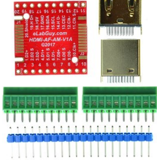
Figure 1: Parts inside the kit (Note: the module is not assembled, user can decide which connector to use on the module.)