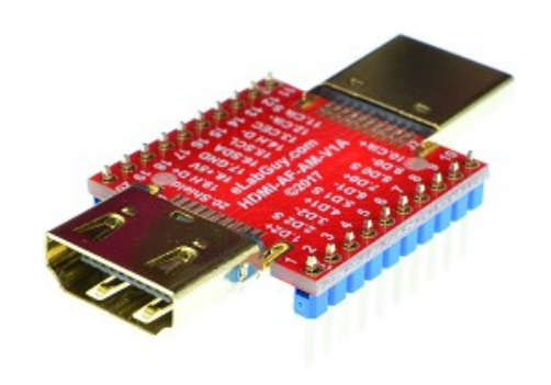
Figure 3: HDMI-AF-AM-V1A with headers